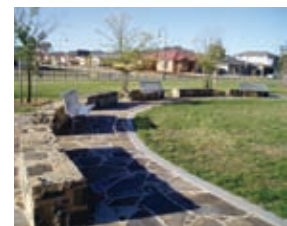
Photos: Open community space is a priority at Harrison Estate.