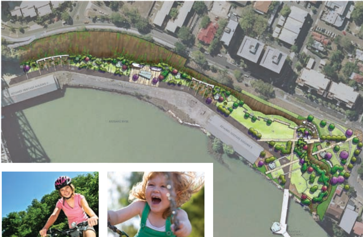
Photos: (opposite top to bottom) The current Howard Smith Wharf precinct, (above) Proposed plans for redevelopment

“ Not only will the revitalisation of the space ensure generations to come can enjoy our rich history, the parklands will be a unique and creative space where locals and tourists can experience the city. ”